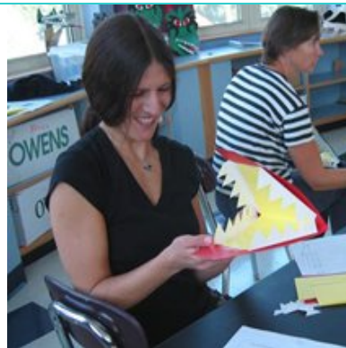
Art Education Workshop