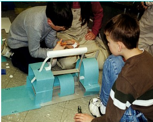
Third Grade Art Class