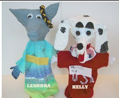
Fourth Grade Paper Maché Puppets