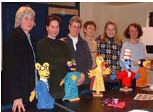
Art Education Workshop