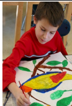
Fifth Grade Painting