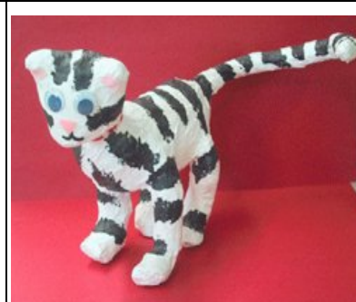
Fifth Grade Paper Maché Animals