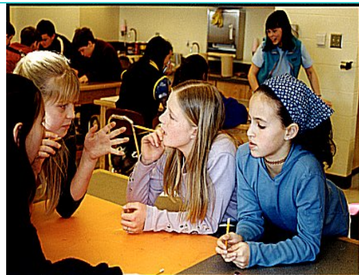
Fifth Grade Art Class